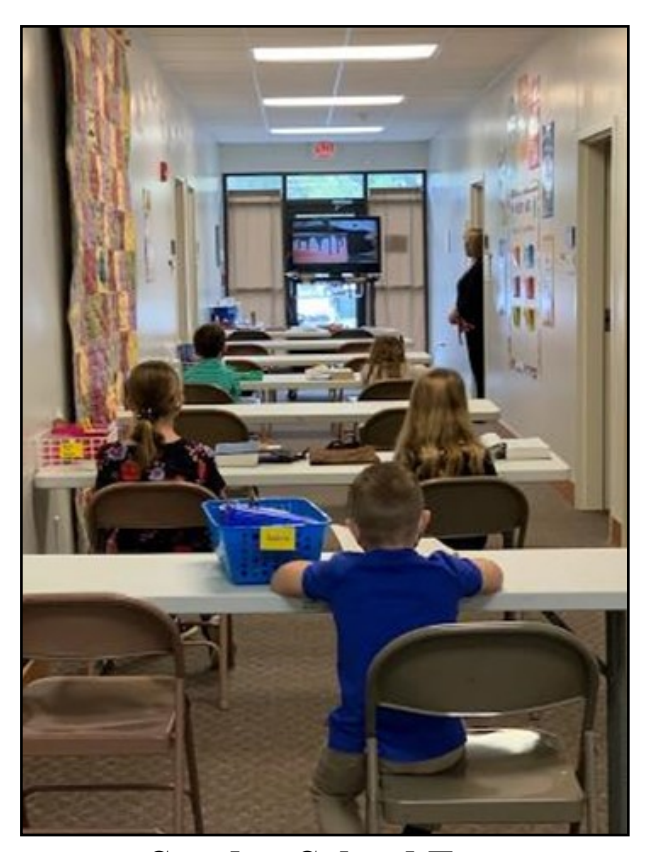
Sunday School Fun